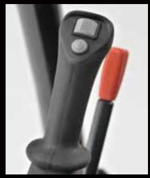
Left control lever

U27-4 is available with a standard AUX1 and AUX2. It enables to further increase machine versatility. The convenient thumb-operated switch on the lever allows easy proportional flow control of the auxiliary circuit.