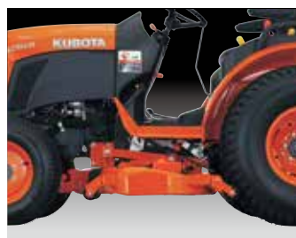
Cutting Height Adjustment Dial Suspended Mower Deck