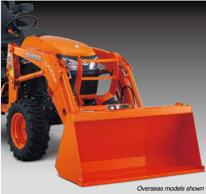
Overseas models shown