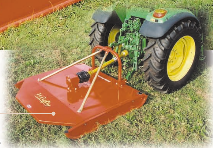
'M80' (features cut off corners for ease of turning)