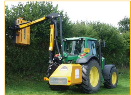
»» PA5570 Hedge Cutting