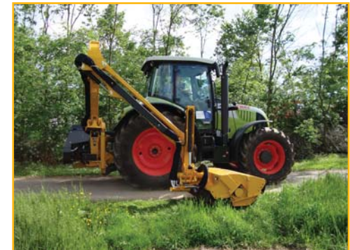
»» VFR Arm-set Option