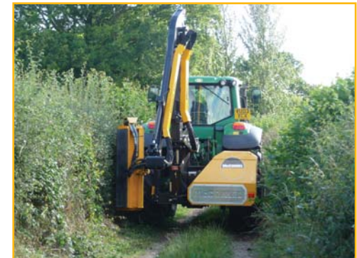
»» Orbital head Option