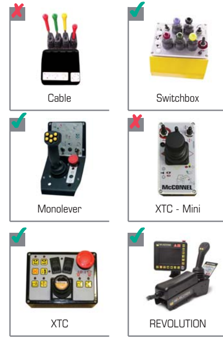
»» Choice of Controls

The boxes that are ticked indicate the control options available for this Power Arm