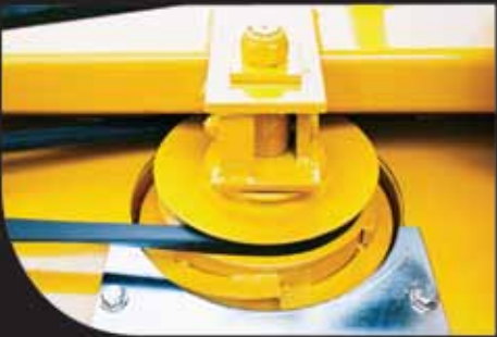
■ Rotor seal system