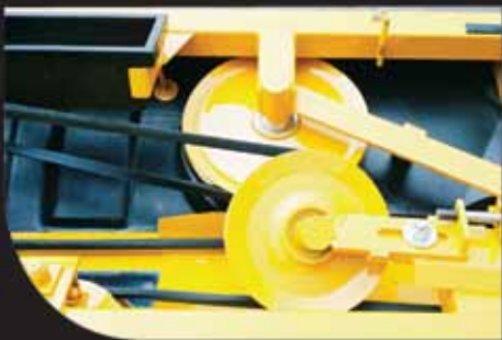
■ Fully sealed drive area