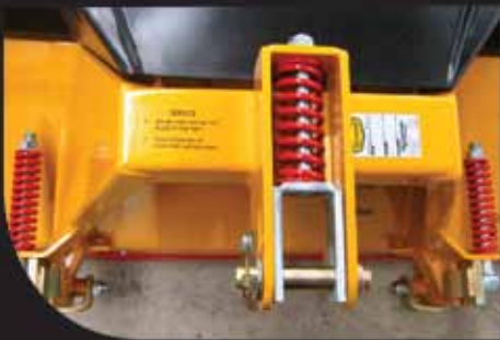
■ Contour Following System