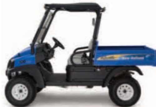
120 : 2 PASSENGER