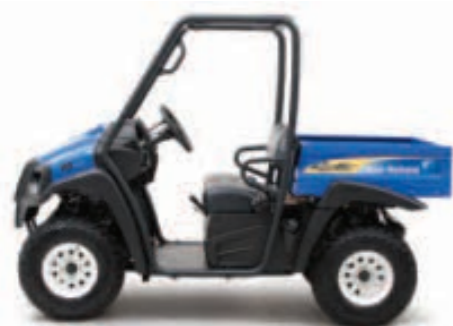
115 : 2 PASSENGER

*Some vehicles shown with optional equipment