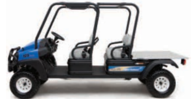
125 : 4 PASSENGER