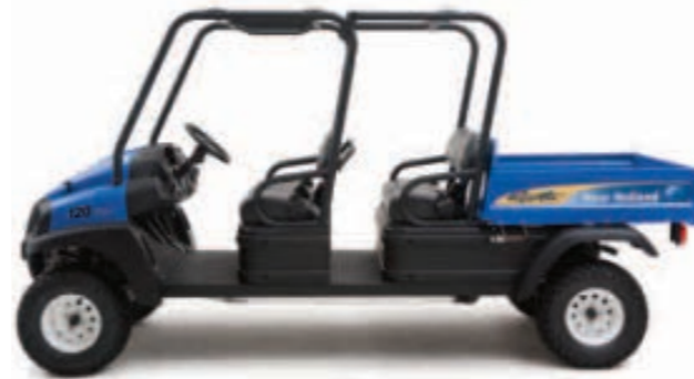
120 : 4 PASSENGER